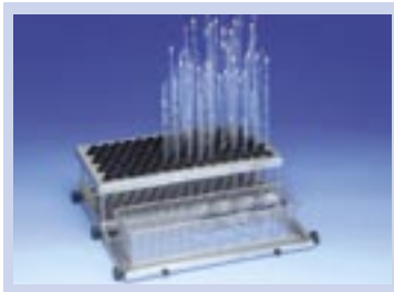
PPI - Pipette Rack