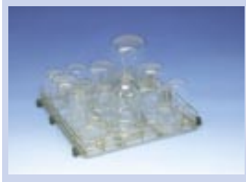
PST - Basket

Basic basket with an added spray arm is available for cleaning on upper levels.