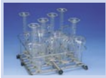
IXL - Jet Rack

For cleaning and drying inside narrow necked laboratory glassware using injectors. Spindle headers inject water, detergent and acid directly into glassware.